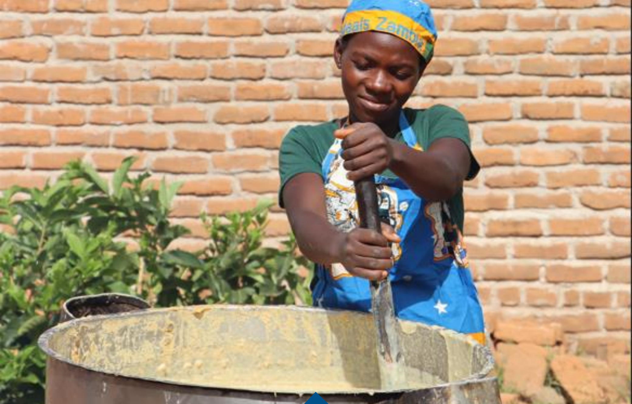
Volunteer Cook - Kamwaza Comm School, Sinda, Eastern Province, Zambia