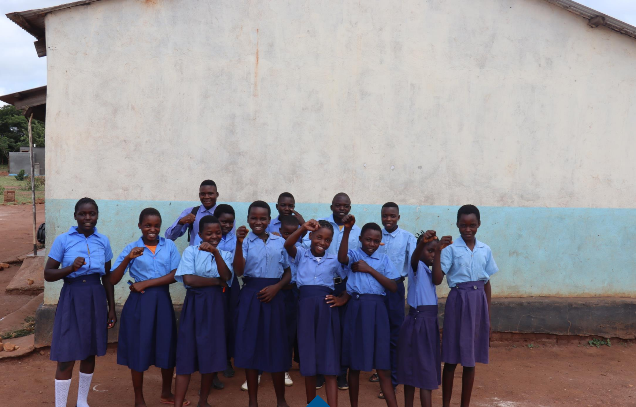
Kamwaza Comm School, Sinda, Eastern Province, Zambia