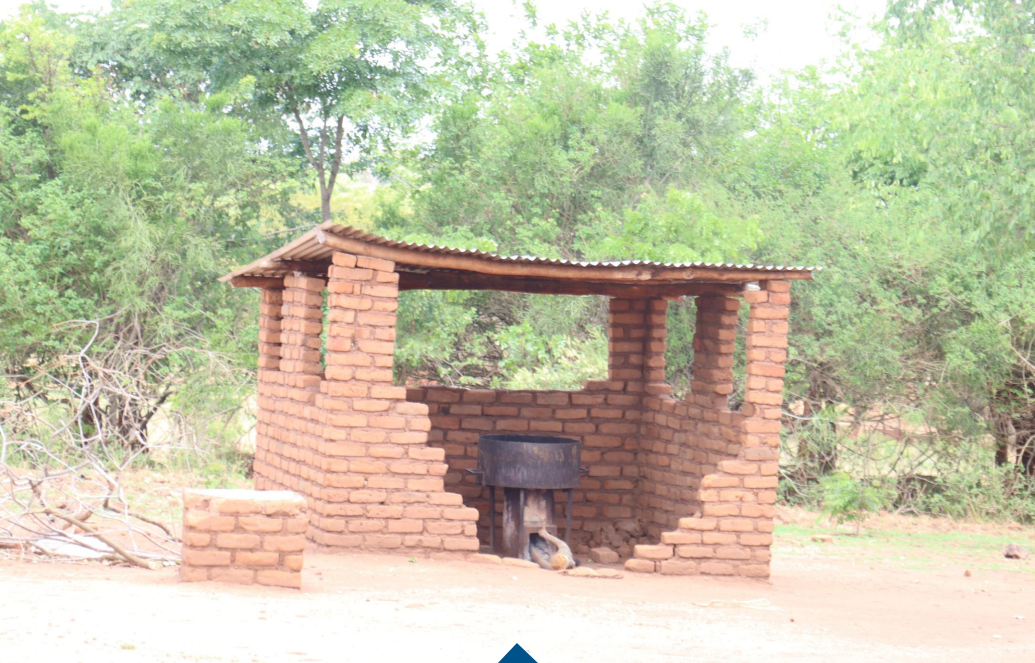
Kamwaza Comm School, Sinda, Eastern Province, Zambia