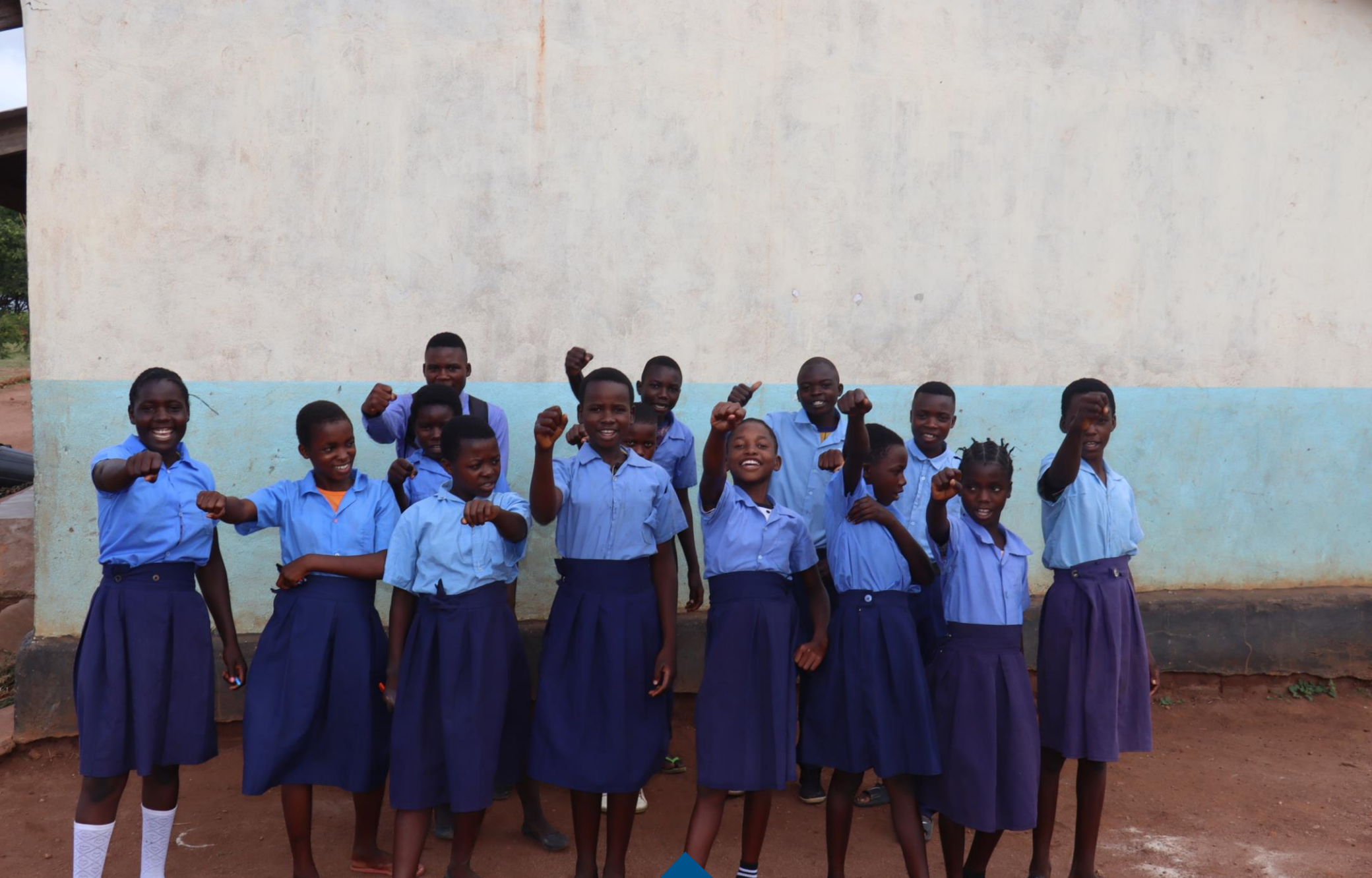
Kamwaza Comm School, Sinda, Eastern Province, Zambia