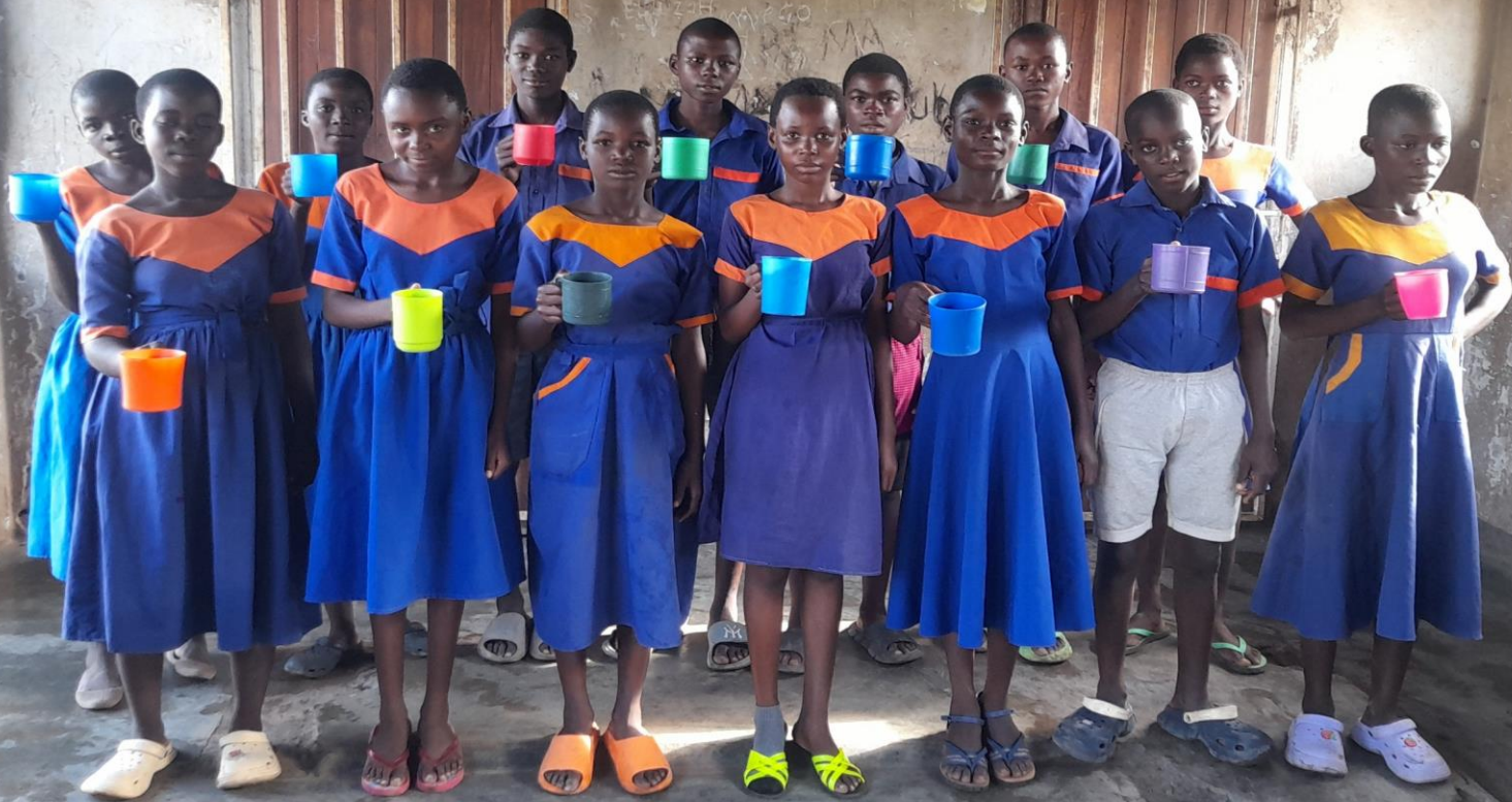
Madugu Primary School, Chikhwawa, Malawi

Madugu Primary School School feeding is sponsored here thanks to generous donors from Mary's Meals Czech Republic; Nick's farthing