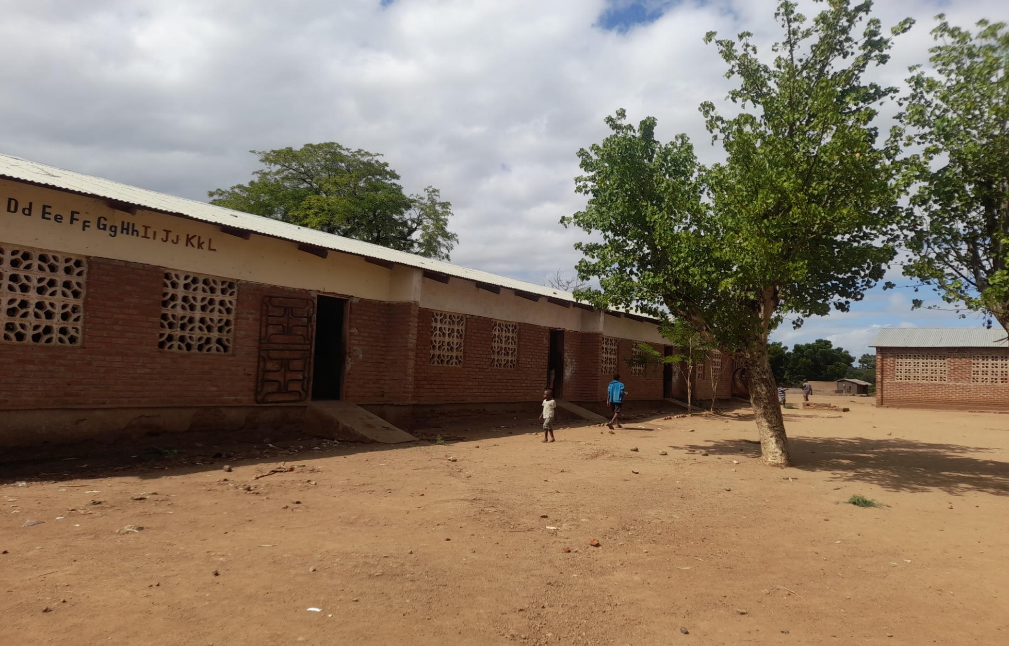
Madugu Primary School, Chikhwawa, Malawi