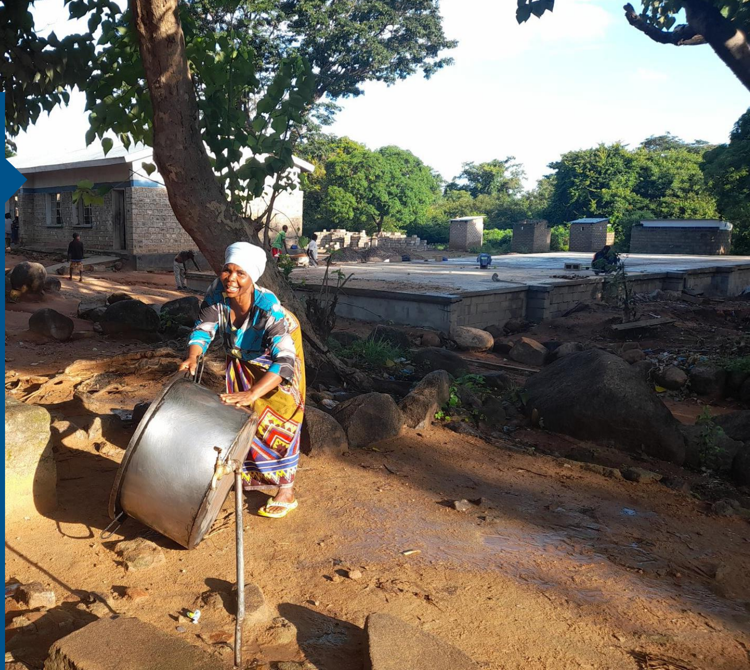
Chiteko Primary School, Likoma, Malawi