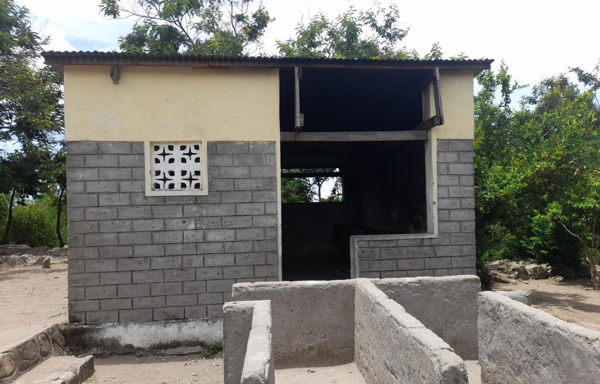
Chiteko Primary School, Likoma, Malawi