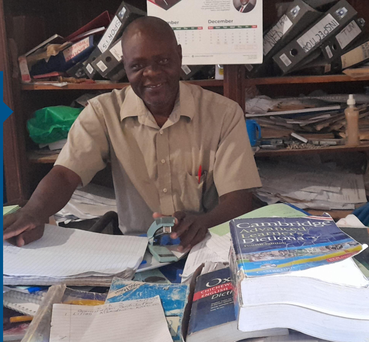
Chiteko Primary School, Likoma, Malawi