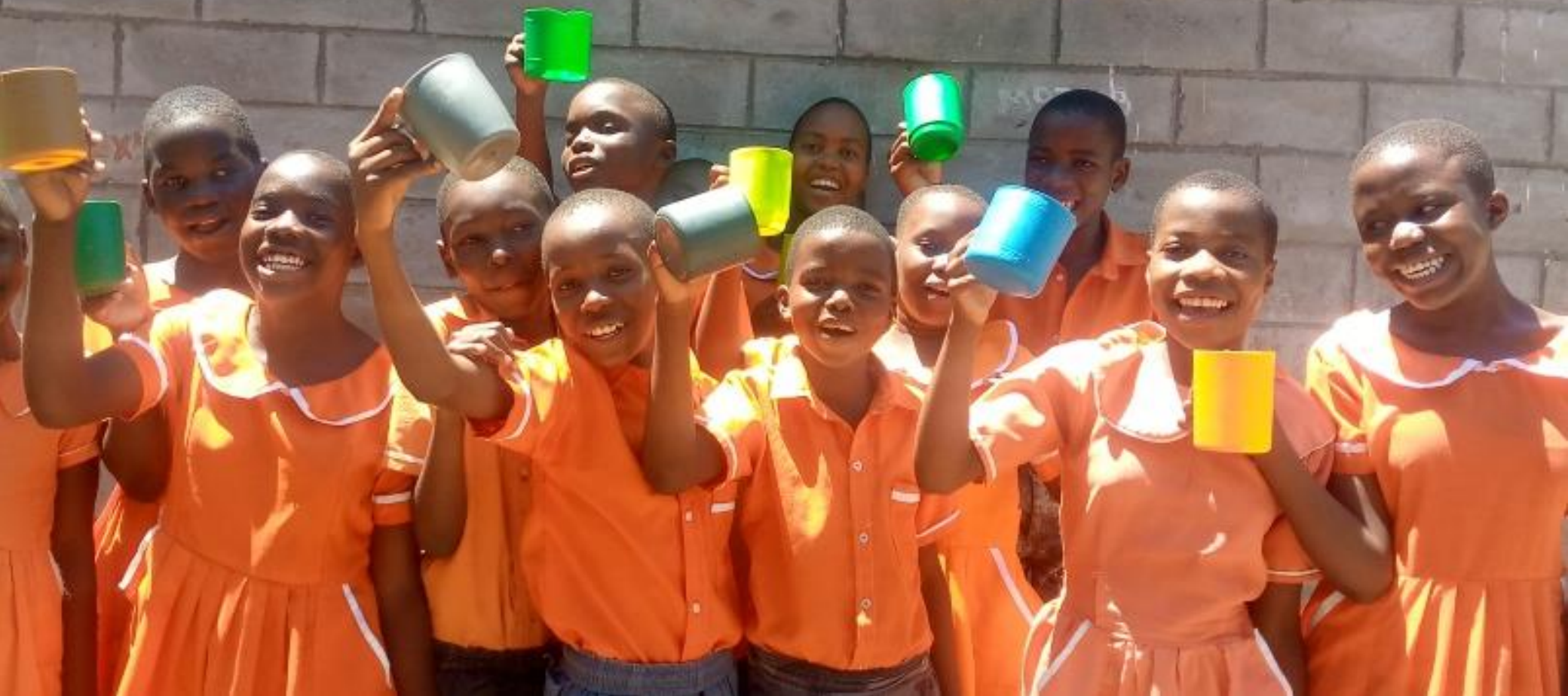
Chiteko Primary School, Likoma, Malawi

School feeding is sponsored here thanks to generous donors from Mary's Meals Czech Republic, Friends from Brno.